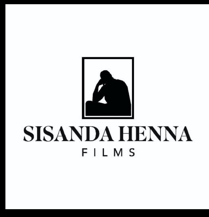
Entertain | Inspire

Sisanda Henna Films is a boutique motion pictures company, producing a select number of projects a year.